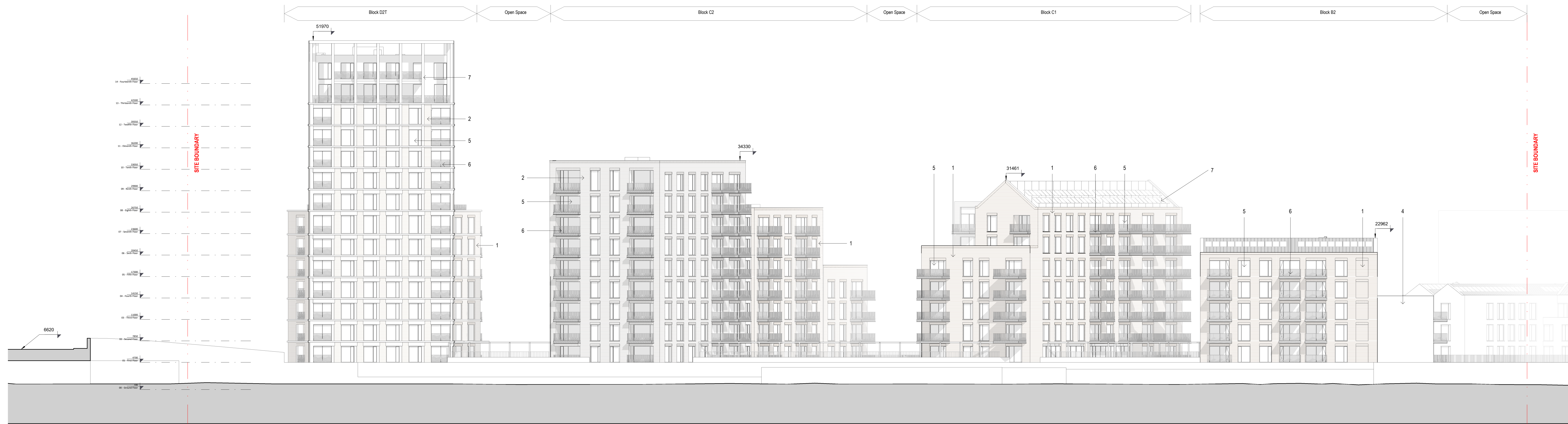
Contextual Site Section 2 1:200