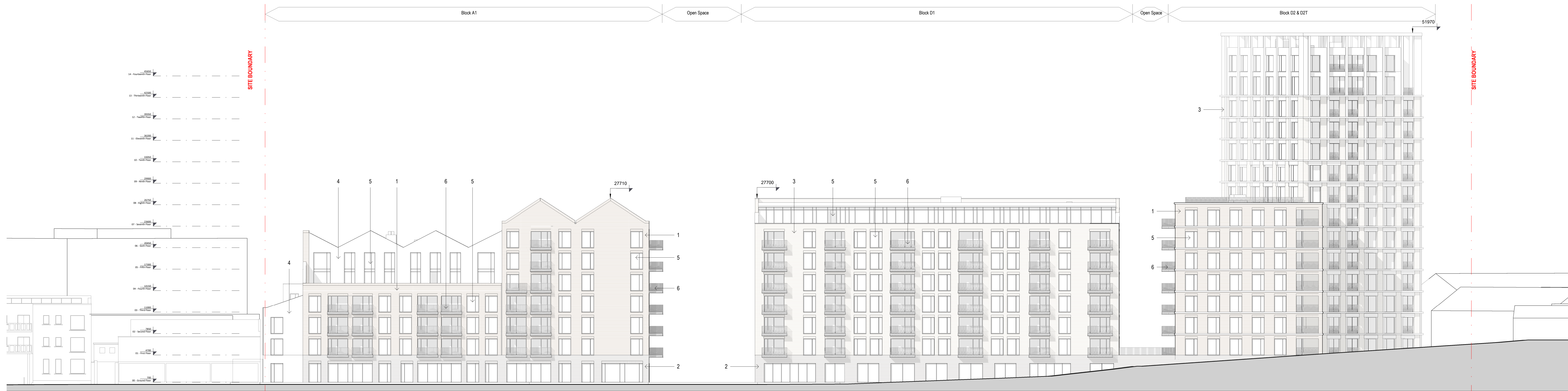
Contextual Site Section 1 1:200